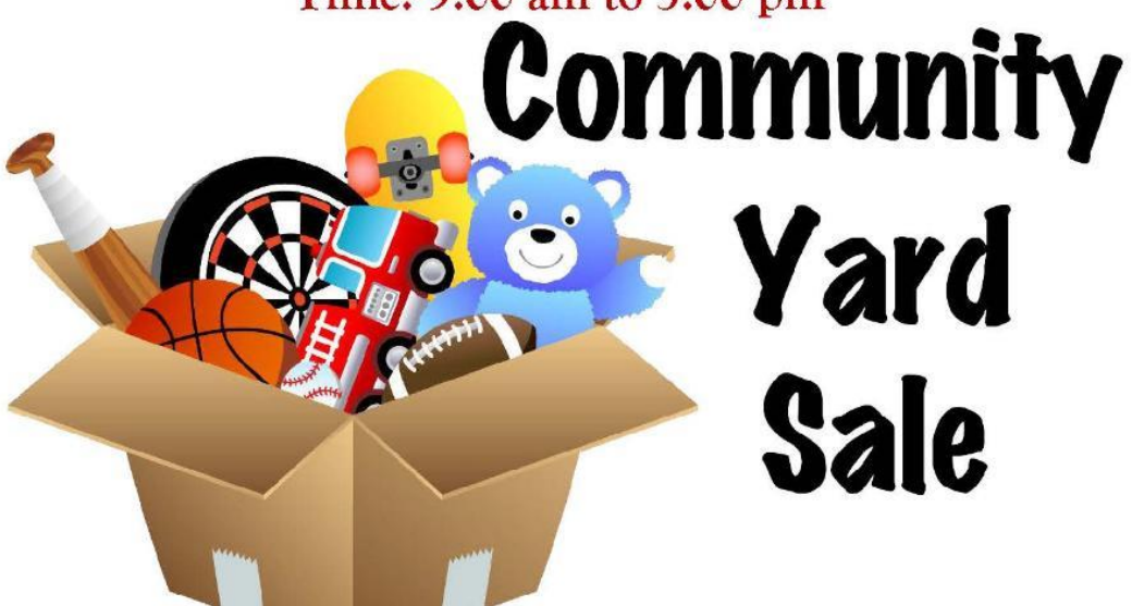
Table: $25 (Includes a Table and 2 Chairs)

To reserve a table and make payment Call - Annette Grubbs: (609) 234-3490